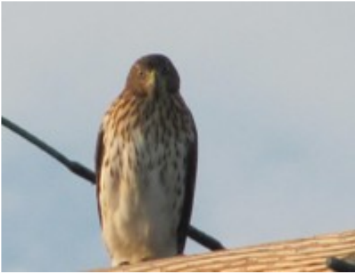
Visitor at Fort Revere.