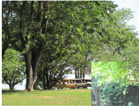
Picnic areas at the Fort