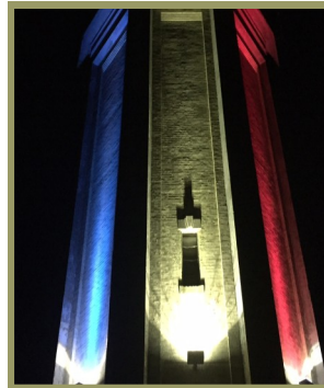
Tower at Fort Revere lit in honor of France October 2015

We hope you find this newsletter interesting and continue to read future Publications. ★