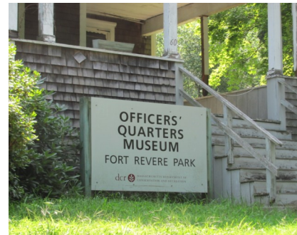
Officers' Quarters Building Farina Road 2012

The Society meets on the first Monday of each month. Join us for updates and details on our plans.